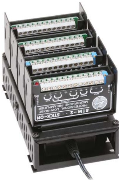
ST-PBR4 mounted on FP-PSB1A power supply bracket.

The FP-PSB1A/ST-PBR4 assembly may be mounted directly to any flat surface or may be mounted in an RDL FP-RRA or FP-RRAH rack panel.