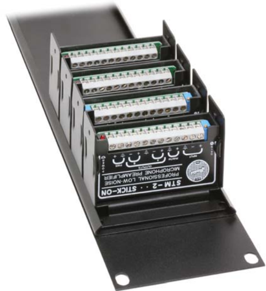
ST-PBR4 mounted in an FP-RRA rack mount panel.

The FP-PSB1A/ST-PBR4 assembly may be mounted directly to any flat surface or may be mounted in an RDL FP-RRA or FP-RRAH rack panel.