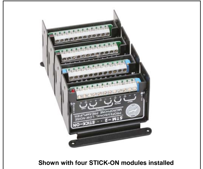
Shown with four STICK-ON modules installed

APPLICATION: The ST-PBR4 is a mounting frame with slots for four STICK-ON modules. The ST-PBR4 mounts on an FP-PSB1A power supply bracket, to any flat surface or in an FP-RRA or FP-RRAH rack panel. The ST-PBR4 design allows the installer to secure the modules without using any adhesive pads. Each module slides in and snaps into position. It may be easily released for adjustment or removal.