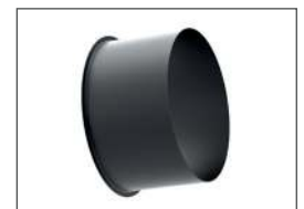
Full Anti Glare Shield