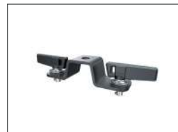
Omega Bracket ST