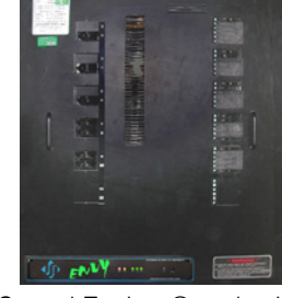
Strand Environ® rack with ENVY digital DMX control