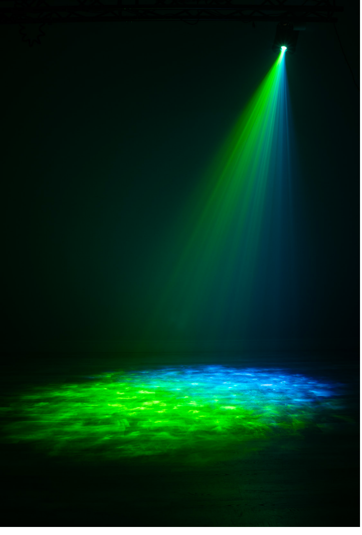
Specifications subject to change.