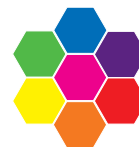
FULL PIXEL CONTROL