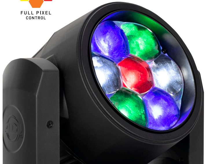
Full Pixel Control