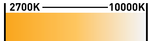
LINEAR COLOR TEMPERATURE CONTROL (TUNABLE WHITE)