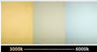
Flat Tri 9 CWWW