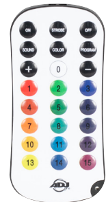
Includes UCIR24 Wireless Remote