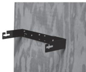
(1) Fix the brackets to the wall

This mounting system can be used for vertical, horizontal or ceiling mounting. If safety rules allow, it is possible to mount the MASK vertically with one bracket only fig.A However in that case we strongly recomend to use a extra safety cable.