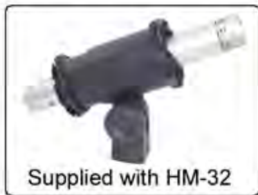
Supplied with HM-32