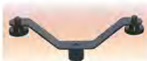
HM-15 Stereo Mount Included