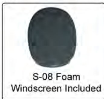
S-08 Foam Windscreen Included