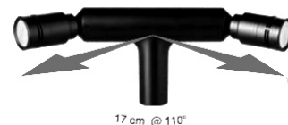
Typical Polar Pattern