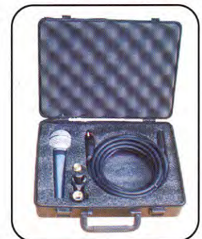
PRO-248C packaged with mic, mic holder, thread adaptor & 20' XLR mic cable.