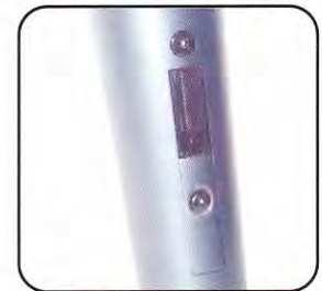
PRO-248S comes with a locking on/off switch.