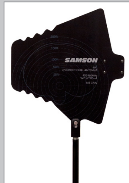
Mic stand, ceiling and wall-mountable