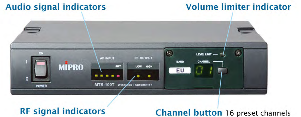
Audio signal indicators

On the rear panel are High/Low power RF outputs , RF output switch (high/low), AF level switch (3 levels), Combo jack , Mic/Line switch