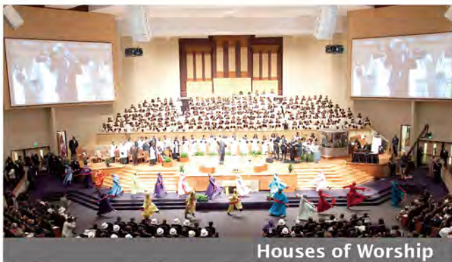
Houses of Worship

New Psalmist Baptist Church Baltimore, Maryland, USA