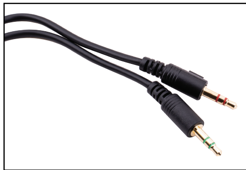
Includes 1 / 8" 3.5mm Mic/ Headphone Connectors

†Specifications subject to change without notice.