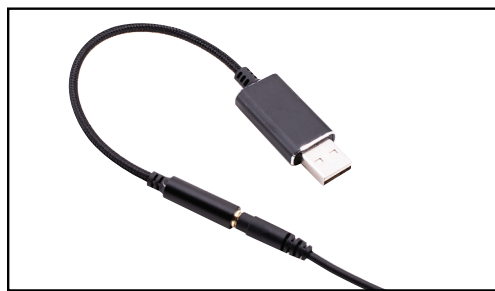
Includes USB Type A Cable and USB Type C Adapter