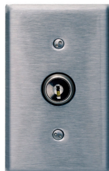
GreenMAX Digital Switches