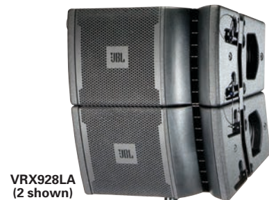
VRX928LA (2 shown)