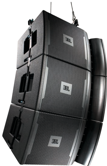
VRX932LA-1 (3 shown) VRX932LAP