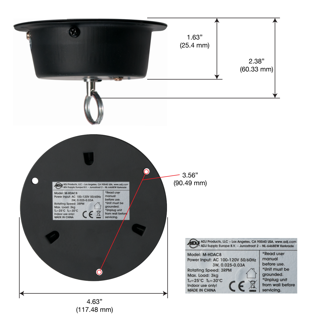
Specifications subject to change without any prior written notice.